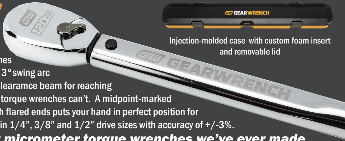
Injection-molded case with custom foam insert and removable lid

They're the best micrometer torque wrenches we've ever made.