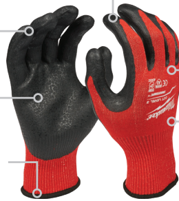
Cut Level 3 Nitrile Dipped Gloves

Color-Coded Bands Easy cut level identification