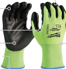
High Visibility Cut Level 2 Polyurethane Dipped Gloves

Color-Coded Bands Easy cut level identification