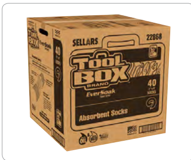
EverSoak® Medium-Duty 4' Absorbent Sock Outer Case

Caution: Not intended for use with aggressive acids or caustics. Dispose of all sorbent materials in accordance with local, state and federal regulations.