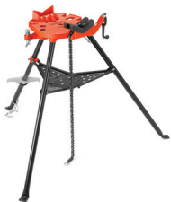
Model 460-12 Portable TRISTAND® Chain Vise Catalog No. 36278