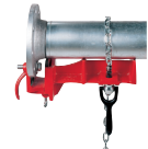
No. 464 Flange Pipe Welding Vise Catalog No. 40235