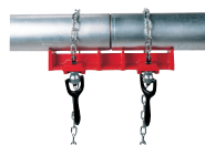
No. 461 Straight Pipe Welding Vise Catalog No. 40220