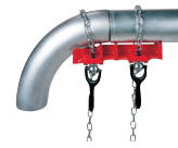
No. 463 Elbow Pipe Welding Vise Catalog No. 40230