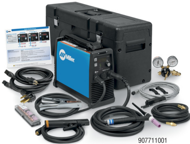
90771001 package shown.

STL TIG/Stick Package 907710001 STL TIG/Stick Package with Remote Fingertip Control 907710002 STH TIG/Stick Package with Remote Fingertip Control 907711001