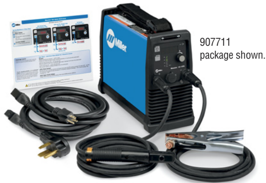
907711 package shown.

STL Standard Package 907710 STH Standard Package 907711