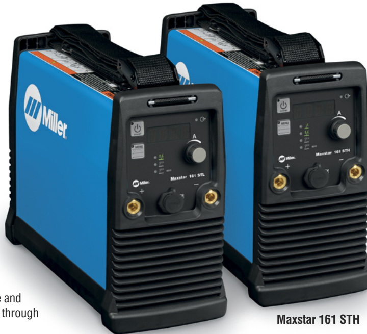
Maxstar 161 STL

Built-in gas solenoid eliminates the need for a bulky torch with a gas valve.