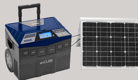
enCUBE battery inverter with 60-watt solar panel

With no engine or need for fuel, enCUBE battery inverter is a clean power source with zero emissions, which means it can be used indoors. It charges through a 120-V AC wall outlet or optional solar panel (sold separately) and is perfect for camping, tailgating or temporary outages at home. Built-in wheels and telescopic handles make it incredibly portable.