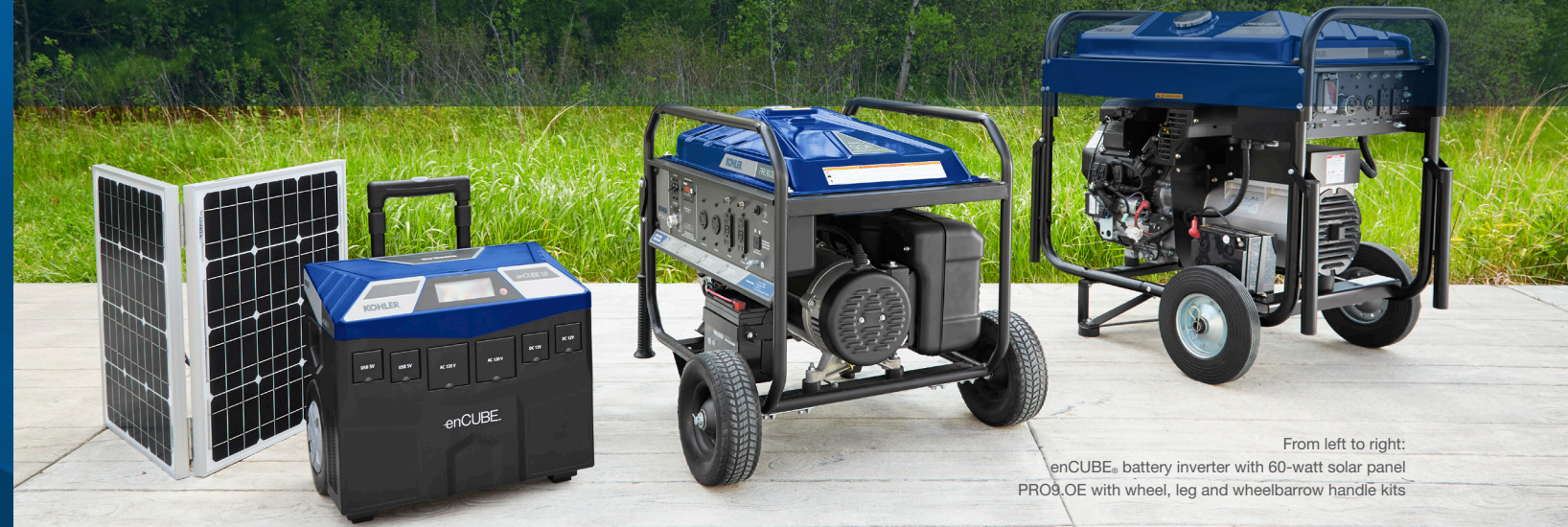
From left to right: enCUBE® battery inverter with 60-watt solar panel PRO9.OE with wheel, leg and wheelbarrow handle kits