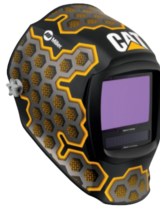
Cat® 2nd Edition 282007