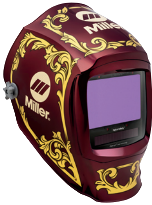
NEW! Imperial™ 280053