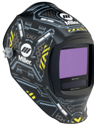
Black Ops™ 280047