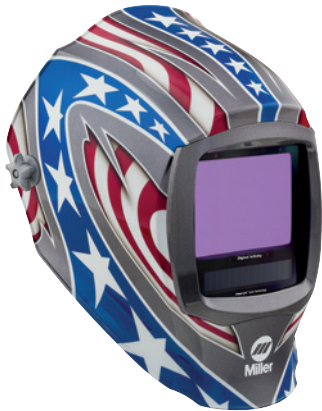
Stars and Stripes™ 280049

©2019 Caterpillar. CAT, CATERPILLAR, BUILT FOR IT and their design marks are registered trademarks of Caterpillar, Miller Electric Mfg. Co. is a licensee of Caterpillar Inc.