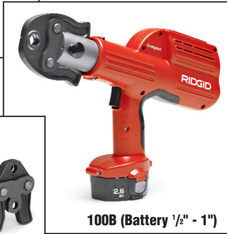
100B (Battery 1/2" - 1")