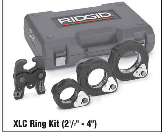
XLC Ring Kit (2 1/2" - 4")